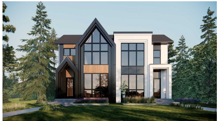
1917 21 Avenue NW (Unit 1)

Welcome to this stunning residence effortlessly combining modern architecture and thoughtful design in the heart of Banff Trail, built by the award-winning ACE HOMES. The home boasts desirable SOUTH REAR EXPOSURE complemented by large windows inviting warmth and light into every corner. Over 2600 SQFT of developed space, provide ample comfort and functionality. This home comes equipped with a 2 BEDROOM LEGAL SUITE, with side entrance & laundry facilities there is great potential as a mortgage helper. The main level unfolds with a generous sized dining room complimented by ample lighting from oversized windows. The kitchen is uniquely placed at the centre of the home with stainless steel appliances and high rise custom cabinets, bar seating & expansive built-in pantry. The addition of a MAIN FLOOR OFFICE enhances productivity & organization. Adding to the convenience of the main floor is a half bathroom & mudroom, with custom built-in storage and bench. Upstairs the expansive primary suite welcomes you with sky high VAULTED CEILING creating the ultimate luxurious retreat. The primary suite includes walk-in closet and outstanding 5-piece ensuite complete with free standing soaker tub and walk-in rain shower. Two secondary bedrooms include tray ceiling detailing adding a lux touch. Laundry room with sink and & a linen closet enhance practicality and storage on this level. The legal basement suite makes an impression with